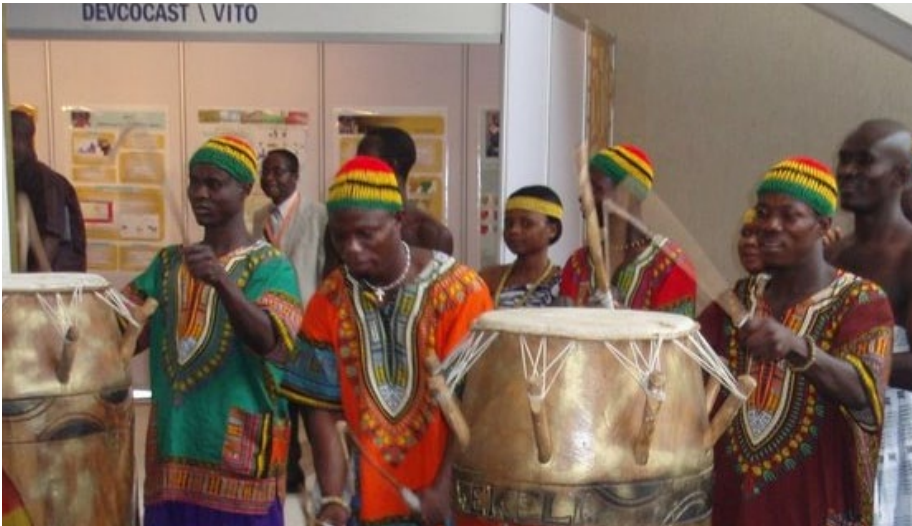
A performance at the African Association of Remote Sensing for the Environment