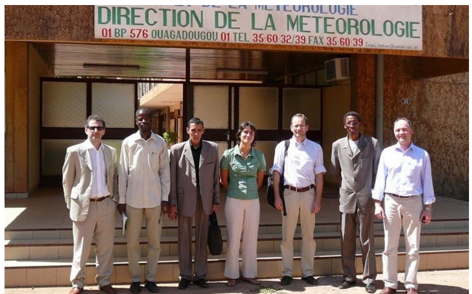
The Mission Team at the Burkina Faso Department of Meteorology

The mission team identified a number of activities which could lead to improved use of space-based information for disaster management in the country. Included in their list of recommendations were: to integrate space-based information elements into the National Multi-risk Contingency Plan currently under development; customized training sessions for remote sensing, GPS and geographic information systems; compilation of existing paper-based disaster information documents and integration of currently delinked information sources; and identification of a national focal point to request imagery from international satellite data mechanisms and to distribute it to the relevant end-users. UN-SPIDER will continue to work with Burkina Faso and the Mission Team in order to move forward with the insights gained. For the biennium 2008-2009, fifteen such UN-SPIDER Technical Advisory Missions are planned. Member States of the United Nations which are interested in receiving such advisory support should contact UN-SPIDER. ■