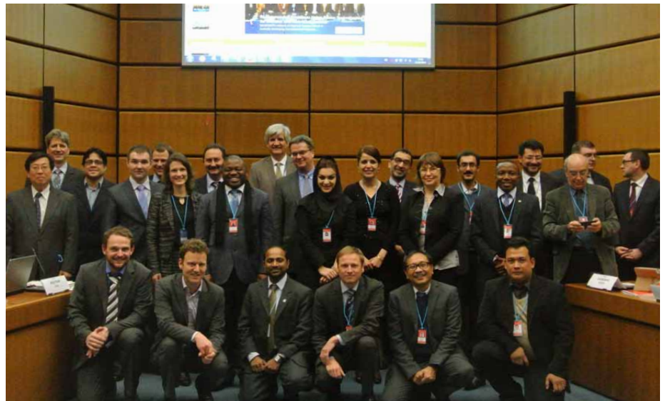
Participants of the fifth Regional Support Offices meeting in Vienna in March 2014

This network of RSOs is quite diverse. Some RSOs are national agencies, including space agencies, civil protection agencies, national geographic institutes or national research facilities or universities. Others are regional