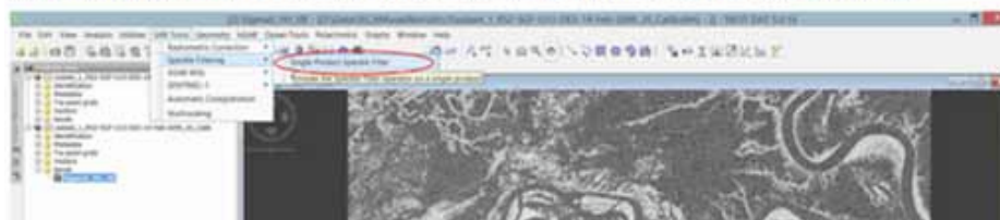
The recommended practice from Ukraine focuses on radar data for flood mapping

2.1 Next step is filtration. Select SAR Tools --> Speckle Filtering --> Single Product Speckle Filter.