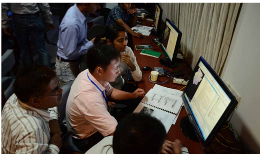
Participants experimenting with landslide detection/mapping algorithms

The participants furthermore learned about SERVIR-Himalaya, a NASA-backed mechanism for emergency response.