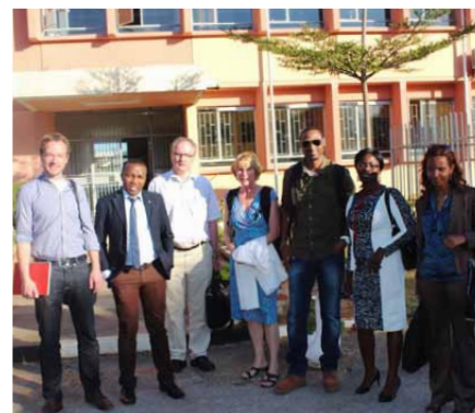
Zambia TAM team, May 2014

In 2013, the Centre participated in a TAM in Malawi. One of the outcomes of this TAM was the need to assist