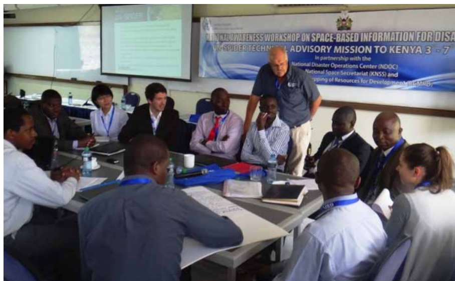
Discussion session at RCMRD during the Kenya TAM in March 2014

RCMRD values this partnership and looks forward to more engagements in the years to come including an expanded mandate to lead TAMs on behalf of UN-SPIDER in the region.